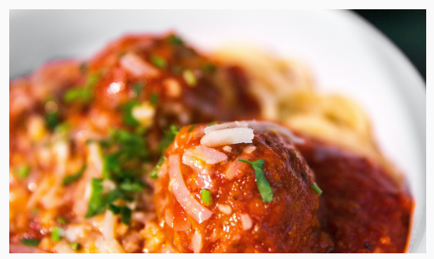
The Spaghetti Dinner will be cooked by youth and served in a banquet-setting.