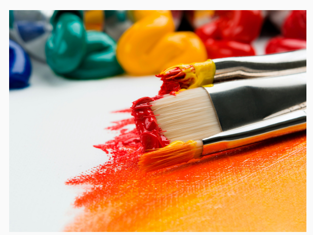
The art show will feature the children's creative talents to their families.

display the creative works of the children in the daycare. This will be Saturday, February 25 from 1:00 PM -4:00 PM.